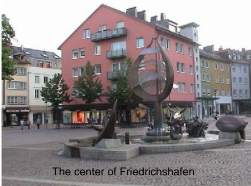
The center of Friedrichshafen

Coming up for ten of the artistic competitors this summer is a trip to Friedrichshafen, Germany to compete in the Landes Turnfest Festival, held July 2 – 6, 2008. This is the championship competition of the Baden Württemberg southern province of Germany. Ten of the boys will be competing at the age appropriate elite level of gymnastics, and will be continuing the cultural exchange that started several years ago between the BGs and the Rottweil Gymnastics Club. The boys will have an opportunity to experience different events, do some sightseeing and will have the opportunity to train at the National Training Centre in Stuttgart. The parents and chaperones may also have the opportunity to "taste" the culture of Germany during the trip. Best of luck to all our athletes.